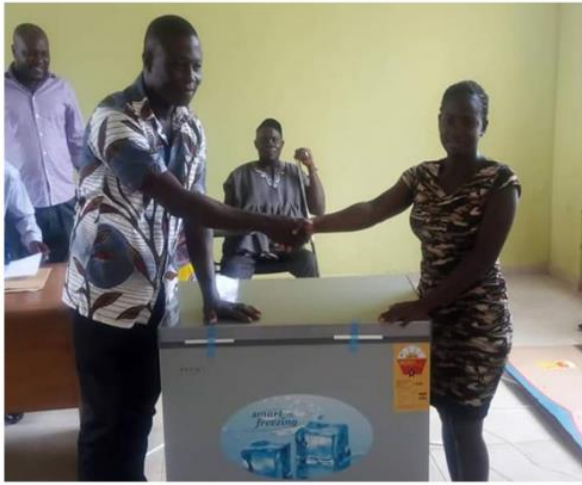
BENEFICIARY RECEIVING A DEEP FREEZER