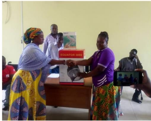
PRESENTATION OF HAIR DRYER