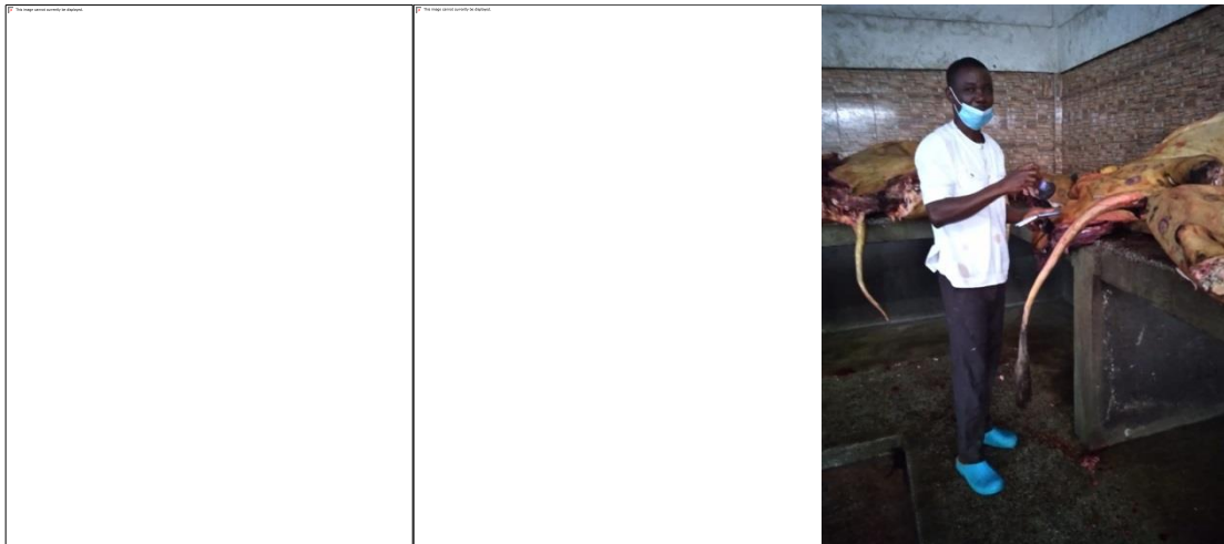
Figure2: An Environmental Health Officer inspecting meat at the Kasoa New Market slaughterhouse on 18th February,2022.

The table below shows the number of food animals slaughtered and inspected