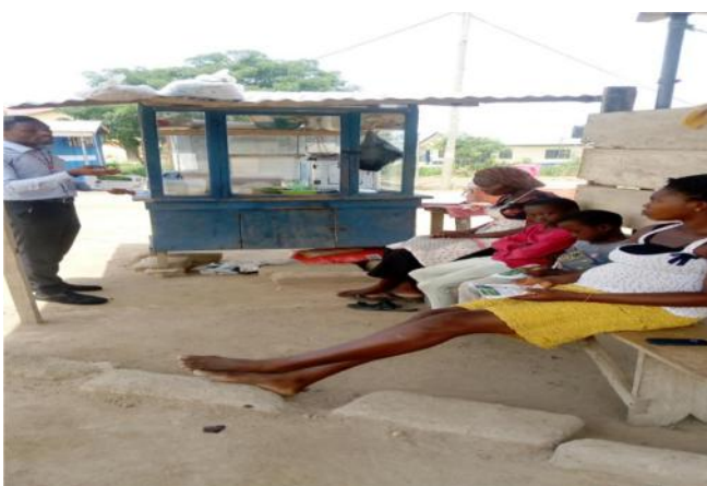
Figure 2 Educating a food vendor and family on COVID-19 at Ofaakor.