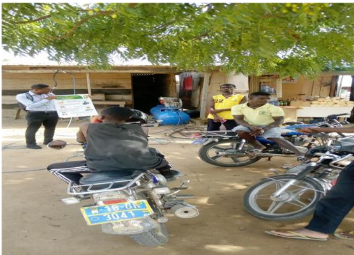
Figure 3 Awutu Senya East ISD NABCO trainee sensitizing folks on prevention measures of COVID-19 at Jei River.