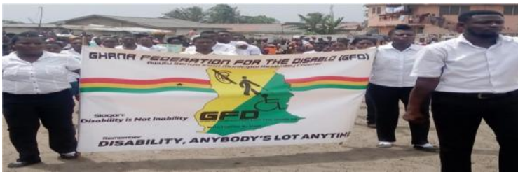
Figure 14 Awutu Senya East GFO in full swing at the parade.