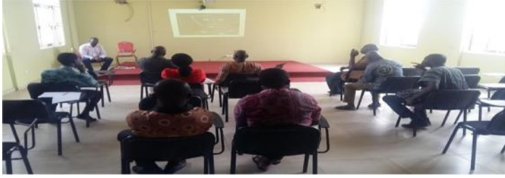
Figure 2 Street addressing team at the meeting.