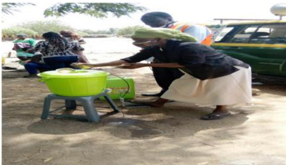
Figure 2 A trader practiced hand washing after the education.