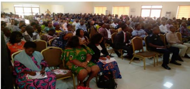
Figure 5 Participants at the workshop.

She noted personal data provided at the registration centres would be confidential since NIA systems have been built to protect everyone's data. The NIA governing board was made up of 10 people, three are appointed by government and the seven others being institutional heads. NIA has been funded by government and therefore the registration exercise was free.