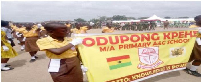
Figure 13 Odupong Kpehe M/A Primary A&C School in a marching mood