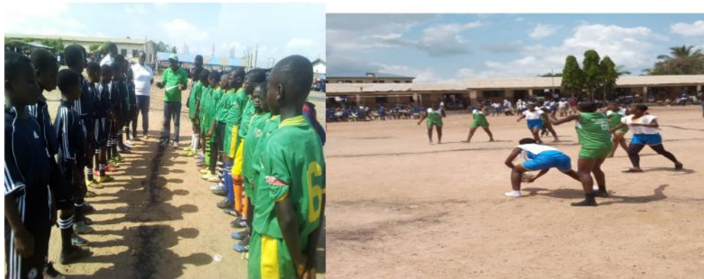
Annual Inter schools sport at Akweley Annual Inter School Sport at Akweley

First Annual inter school sport festival was organized at Akweley circuit during the period under review.