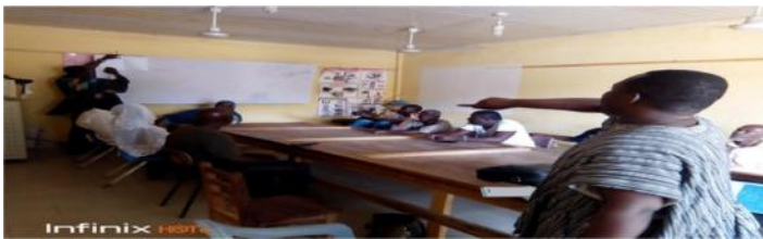
Figure 7 Street naming meeting at Banat International School, Newtown electoral area.