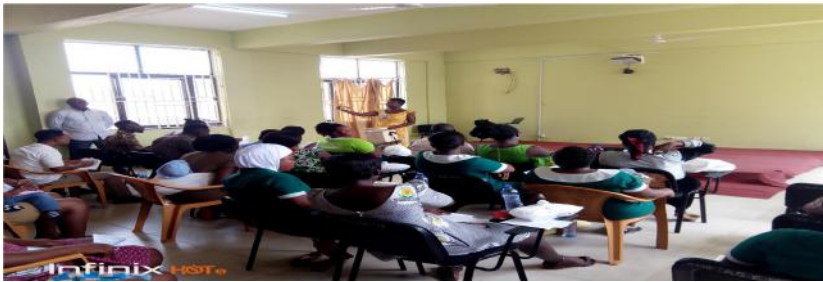
Figure 10 Facilitator taking participants through the practical session of the training.