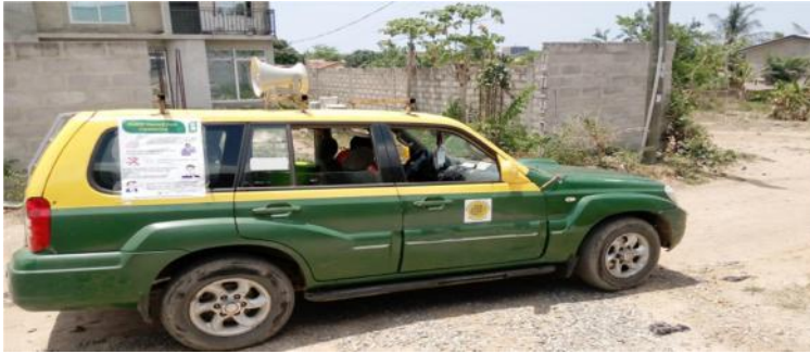
Figure 1 ISD Van Outreach team at CP Walantu and its surroundings.