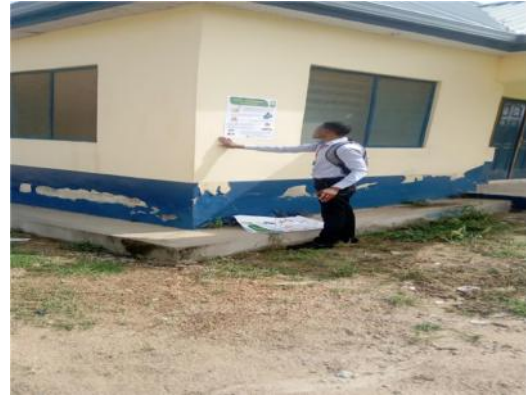
Figure 3 Pasting COVID-19 posters