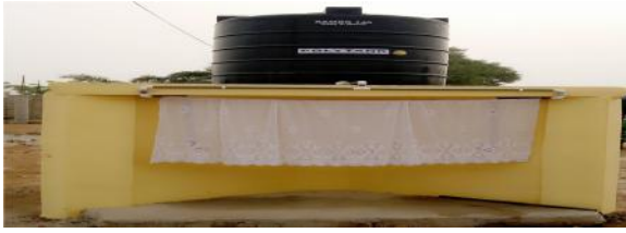
Figure 9 Commissioned borehole for Lamptey Mills community.