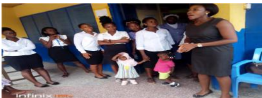
Figure 1 Awutu Senya East Information Assistant sensitizing a focal group on the Ghana Card registration.