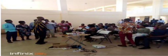
Figure 12 Award presentations to the Shalom city landlords and Residents Association