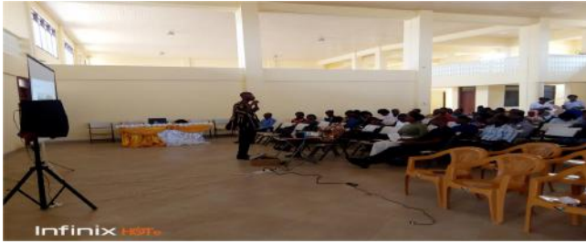
Figure 11 Municipal Health Director giving a presentation on the health review.