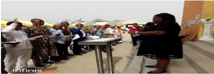
Figure 8 Her Ladyship swearing in the new Assembly members