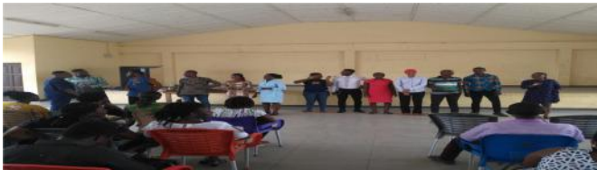
Figure 1 committee members appointed by the NASPA Executives.