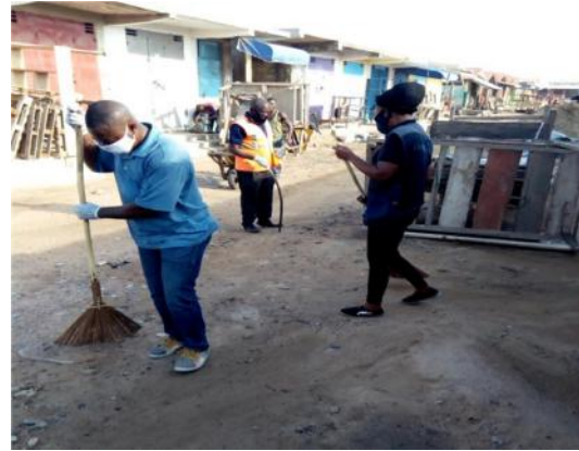
Figure 4 MCE AND MCD of Awutu Senya East at the clean-up exercise at the New Market.