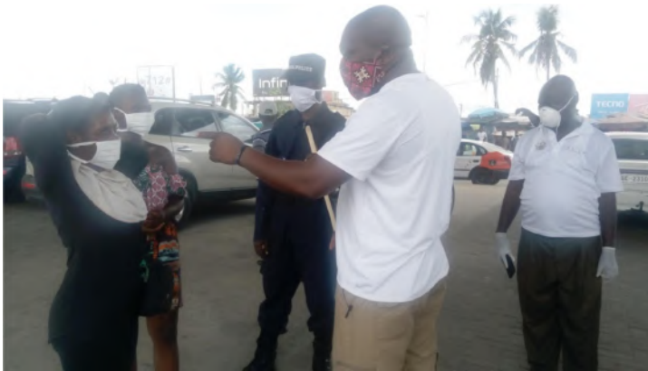
Figure 2 MCE enforcing wearing of nose masks