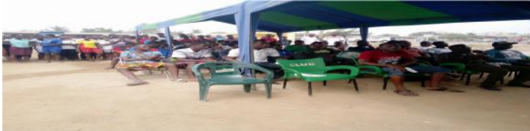
Figure 2 An overview of the crowd.