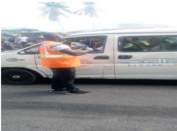
Figure 3 Awutu Senya East NADMO checks drivers for nose masks and sanitizers

GENERAL: In the first quarter of the year, the Municipal Assembly observed some activities which include: A National Identification Authority workshop for National Commission for Civic Education (NCCE), Information Services Department (ISD) and the Ghana Police Service(GPS) at the Pempamsie hotel, Cape Coast on Thursday, 9 th January,