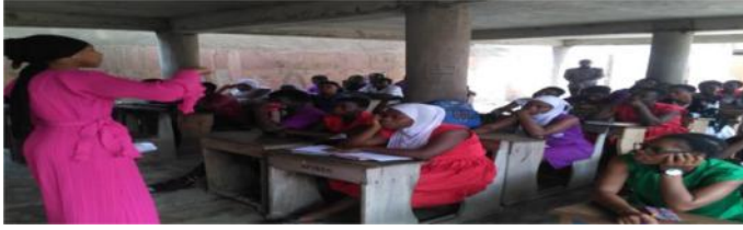
Figure 2 Awutu Senya East Information Officer educating students on the Ghana Card mass registration exercise.