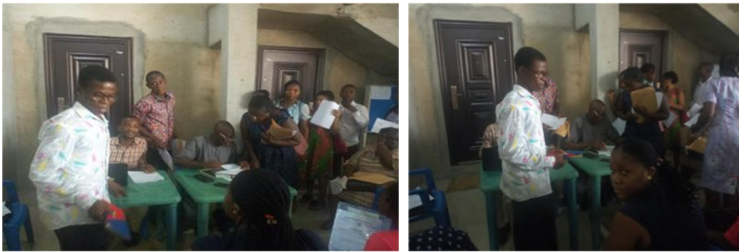
GNAT Workshop for teachers towards 2020 Aptitude test organized at Kasoa