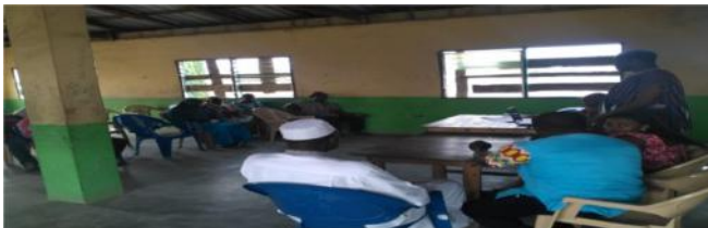
Figure 6. Street naming meeting at Newtown electoral area.